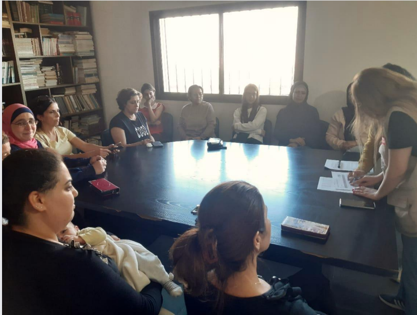
Community consultations on MPCA design