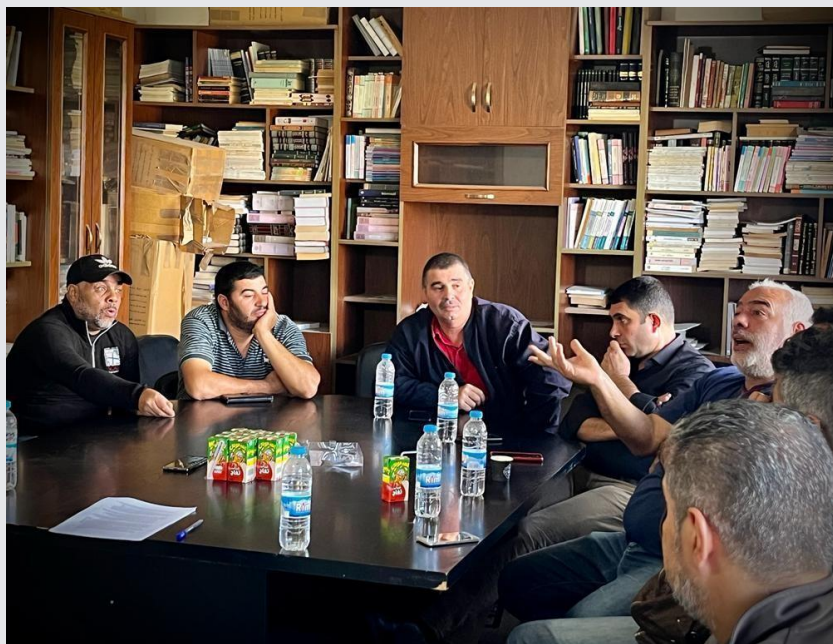
Community consultations on MPCA design